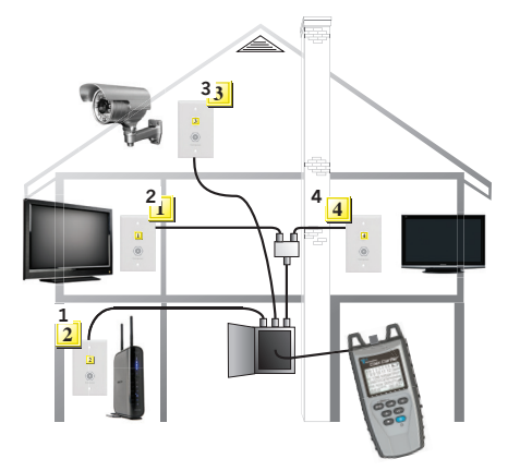
Identifies Coax remotes through splitters